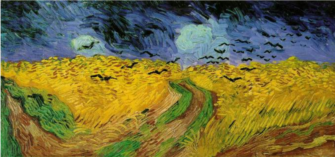
Wheat Field with Crows by Van Gogh, 1890: Vincent Van Gogh used swirling brush strokes in many of his Post-Impressionist works.

artists were slightly younger than the Impressionists, and their work contemporaneously became known as Post-Impressionism. Some of the original Impressionist artists also ventured into this new territory. Camille Pissarro briefly painted in a pointillist manner, and even Monet abandoned strict en plein air painting. Paul Cézanne, who participated in the first and third Impressionist exhibitions, developed a highly individual vision emphasizing pictorial structure; he is most often called a post-Impressionist. Although these cases illustrate the difficulty of assigning labels, the work of the original Impressionist painters may, by definition, be categorized as Impressionism.