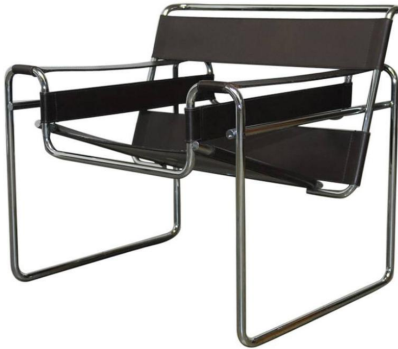
Marcel Breuer, Armchair, c. 1928. Chrome plated tubular steel with canvas slings. MoMA PDUS read more about Breuer here: https://www.1stdibs.com/furniture/seating/armchairs/mid-century-wassily-chair-marcel-breuer-stendig/id-f_5801443/#0

The school existed in three German cities: Weimar from 1919 to 1925, Dessau from 1925 to 1932, and Berlin from 1932 to 1933, under three different architect-directors: Walter Gropius from 1919 to 1928, Hannes Meyer from 1928 to 1930, and Ludwig Mies van der Rohe from 1930 until 1933, when the school was closed by its own leadership under pressure from the Nazi regime, having being painted as a centre of communist intellectualism. Although the school was closed, the staff continued to spread its idealistic precepts as they left Germany and emigrated all over the world.