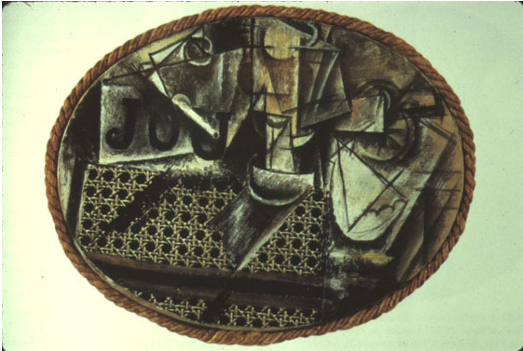
Pablo Picasso, Still Life with Chair Caning , 1912, oil on oil-cloth over canvas edged with rope, 29 x 37 cm (Musée Picasso)

behind. In his Still Life with Chair Caning , commercially printed oilcloth creates the “seat” of the chair and the objects on a café tabletop are painted. The scalloped edge of the table is created from rope with an invisible join!