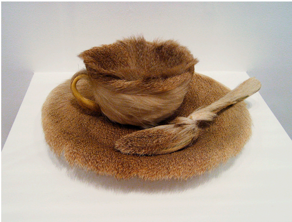
Meret Oppenheim, Object (Luncheon in Fur) , 1936. Fur-covered cup, saucer, and spoon; h. 2 7/8". MoMA via http://leslouille.blogspot.com/2012/10/expose-sur-meret-oppenheim-le-dejeuner.html

Like Dada, Surrealism aimed to revolutionize human experience, in terms of the personal, cultural, social, and political aspects. Surrealists wanted to free people from false rationality, and also from restrictive customs and structures. Breton proclaimed that the true aim of Surrealism was "long live the social revolution, and it alone!"