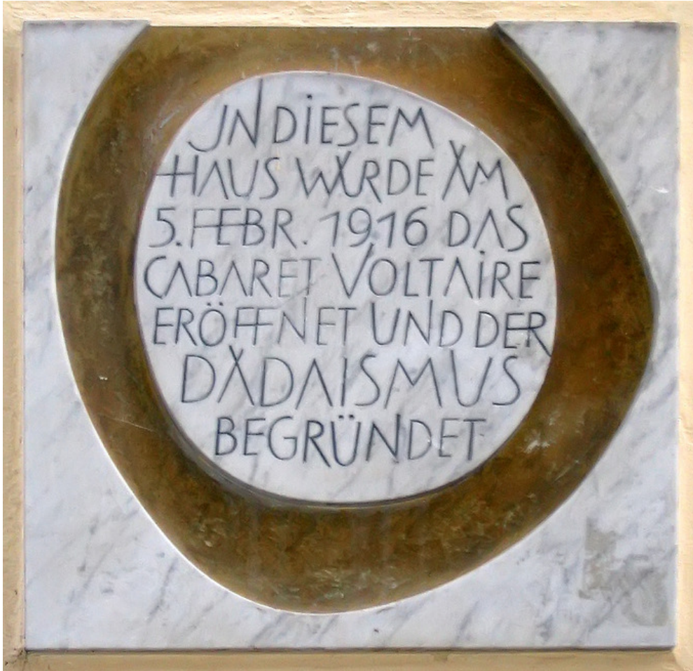
Plaque commemorating the birth of Dada movement: This plaque is from the Cabaret Voltaire, the first venue where Dada artists showcased their work in 1916.

Dada was an informal international movement with participants in Europe and North America that employed all kinds of media but are known especially for collage, writing, photomontage and performance. Dadaists worked in collage, creating compositions by pasting together transportation tickets, maps, plastic wrappers and other artifacts of daily life. Dada artists also worked in photomontage, a variation on collage that utilized actual or reproductions of photographs printed in the press. In Cologne, Max Ernst used photographs taken from the front during World War I to comment on the war. Another variation on collage used by Dadaists was assemblage, the assembly of everyday objects to produce meaningful or meaningless pieces of work, including war objects and trash.