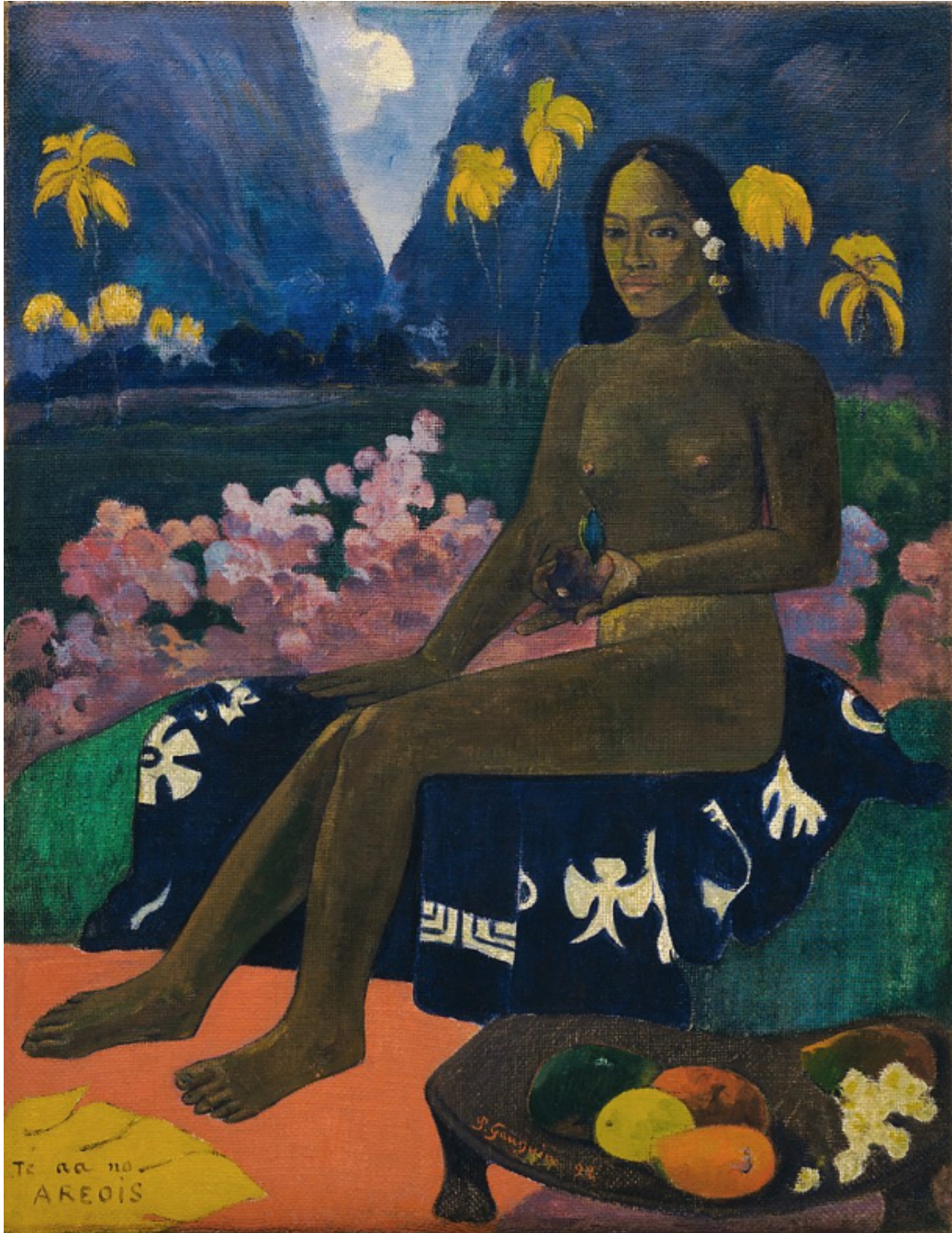
Gauguin, Tea a no areois (The Seed of the Areoi) , 1892, oil on burlap, 36.3 x 28.4", MoMA. PD US SAFhIKAr_n0oUg at Google Cultural Institute