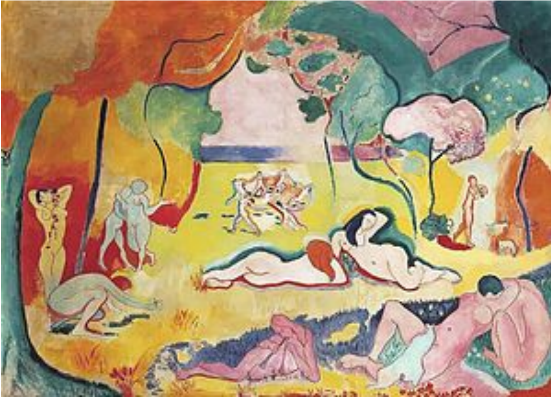
Henri Matisse, The Joy of Life, 1905-06. Oil on canvas, 5'81/2" x 7'91/4", Philadelphia.

Matisse vied for the title of King of the Avant-garde with Picasso during the first decade or so of the twentieth century. Paintings like Joie de Vivre or Joy of Life had conventional subject matter – a pastorate setting for music, dance, and love – but pictured very differently. He divorces color from form and creates a gentle fantasy that American chemist, businessman, and art collector. His Barnes collection in Philadelphia has many of Matisse's most formidable works.