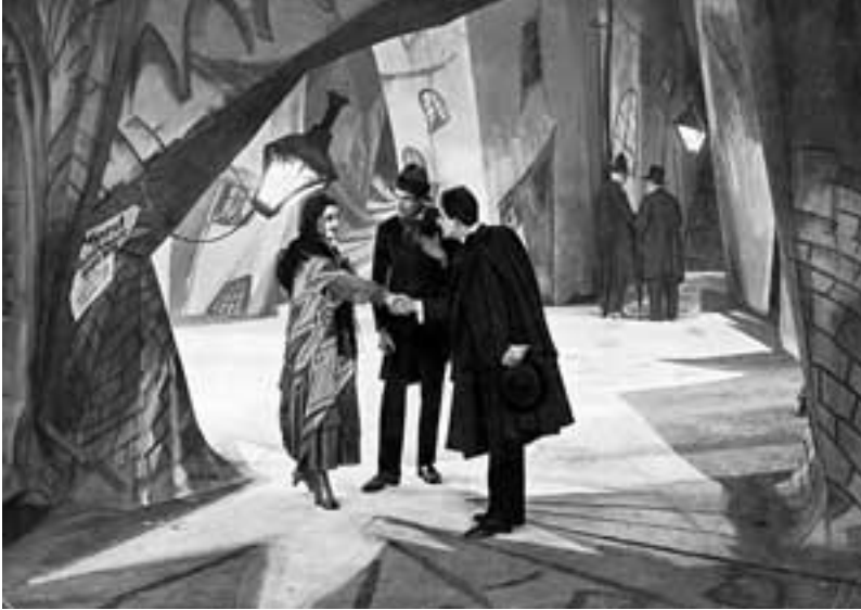
Still from the 1920 film The Cabinet of Dr. Caligari, Robert Wiene, director.

Expressionist painters had many influences, among them Edvard Munch, Vincent van Gogh, and several African artists. They were also aware of the Fauvist movement in Paris, which influenced Expressionism's tendency toward arbitrary colors and jarring compositions.