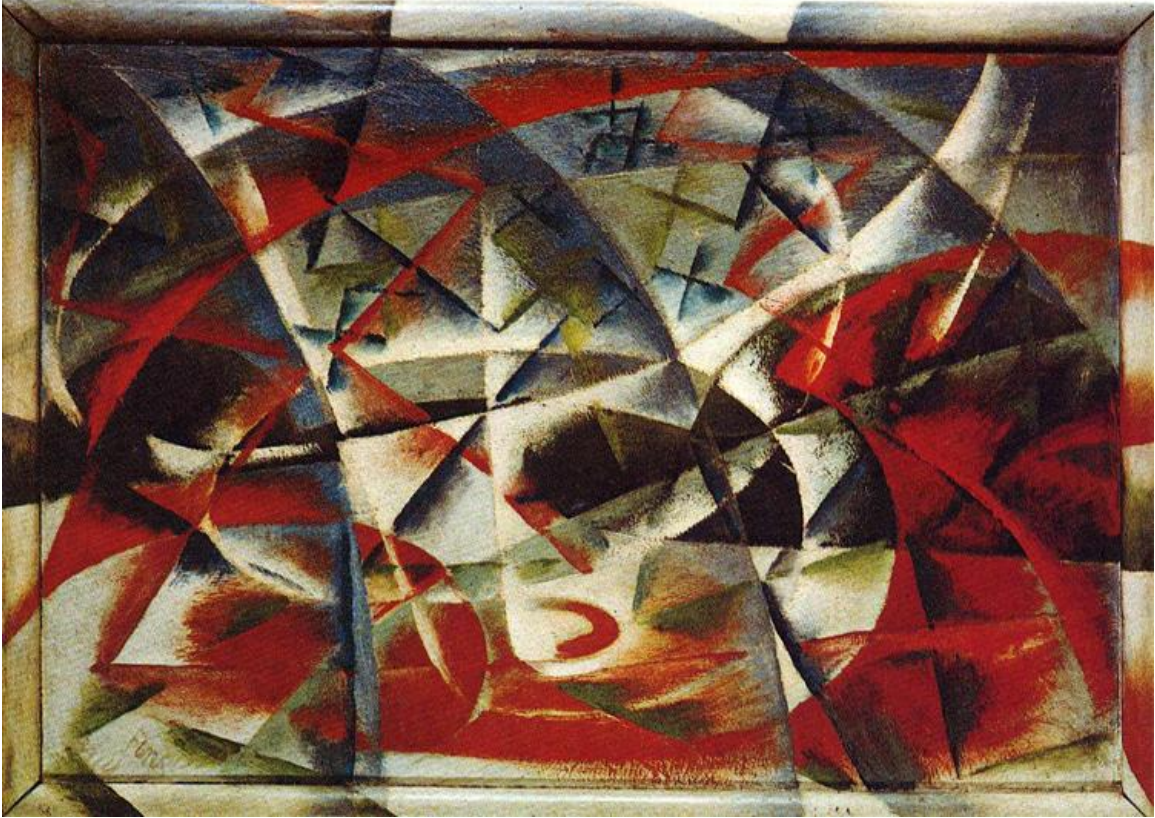
Abstract Speed + Sound , by Giacomo Balla 1913–1914: This is a seminal work from the Futurist movement which was influenced by Cubism. Public domain US