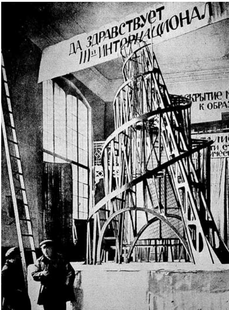
Vladimir Tatlin, Monument to the Third International, 1919, model.

The canonical work of Constructivism was Vladimir Tatlin's proposal for the Monument to the Third International (1919), which combined a machine aesthetic with dynamic components celebrating technology such as searchlights and projection screens. Gabo publicly criticized Tatlin's design, saying he should "Either create functional houses and bridges or create pure art, not both." This position had already caused a major controversy in the Moscow group in 1920, when Gabo and Pevsner's Realistic Manifesto asserted a spiritual core for the movement. This was opposed to the utilitarian and adaptable version of Constructivism held by Tatlin and Rodchenko. Tatlin's work was immediately hailed by artists in Germany as a revolution in art. A 1920 photograph shows George Grosz and John Heartfield holding a placard saying "Art is Dead—Long Live Tatlin's Machine Art." The designs for the tower were published in Bruno Taut's magazine Fruhlicht .