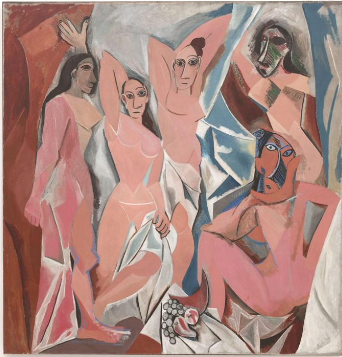
Les Desmoiselles D'Avignon by Picasso, 1907: Picasso is a ubiquitous (common) example of a modernist painter.

Modernism is defined in Latin America by painters Joaquín Torres García from Uruguay and Rufino Tamayo from Mexico, while the muralist movement with Diego Rivera, David Siqueiros, José Clemente Orozco, Pedro Nel Gómez, and Santiago Martínez Delgado, and Symbolist paintings by Frida Kahlo, began a renaissance of the arts for the region, characterized by a freer use of color and an emphasis on political messages. The end of modernism and beginning of postmodernism is a hotly contested issue, though many consider it to have ended roughly around 1940.