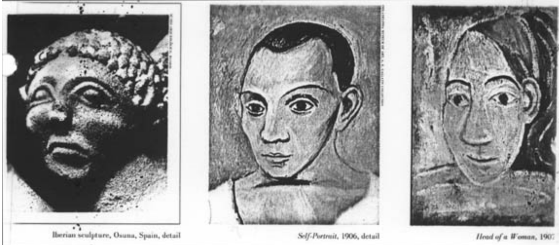
Pablo Picasso, Self-Portrait , 1906, oil on canvas. PD US

In 1907, Picasso experienced a “revelation” while viewing African art at the ethnographic museum at Palais du Trocadéro. African art influenced Picasso’s painting Les Femmes d’Alger (1907), especially in its treatment of the two figures on the right side of the composition. This painting is also considered a protocubist work bridging Picasso’s African and Cubist periods.