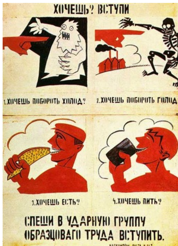
Agitprop poster by Mayakovsky: Mayakovsky worked for the Russian State Telegraph Agency (ROSTA) creating—both graphic and text—satirical Agitprop posters.

There was a great deal of overlap during this period between Constructivism and Proletkult; the ideas of Proletkult concerning the need to create an entirely new culture struck a chord with the Constructivists. In addition, some Constructivists were heavily involved in the "ROSTA Windows," a Bolshevik public information campaign carried out around 1920. Some of the most famous of these were by the poet-painter Vladimir Mayakovsky and Vladimir Lebedev.