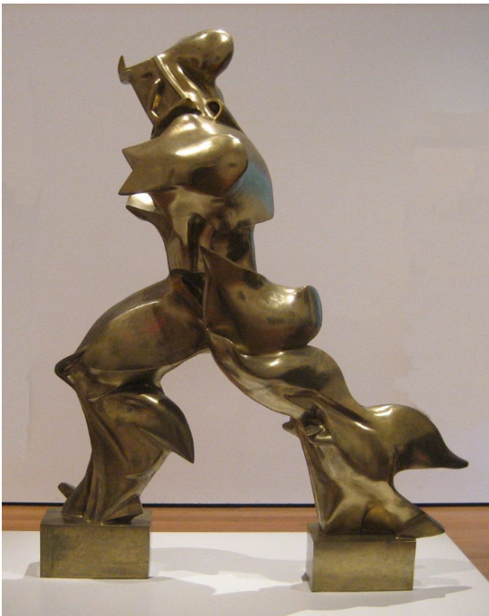
Umberto Boccioni, Unique Forms of Continuity in Space , 1913. Bronze sculpture. MoMA PD US