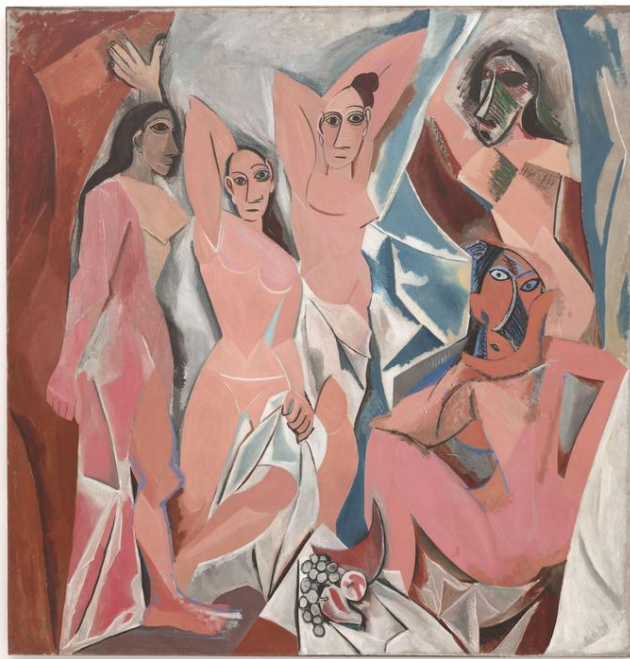
Les Femmes d'Alger (O Version O) by Pablo Picasso, 1907: This work is influenced by primitivism and is considered to be one of the earliest examples of Cubist painting.

Cerrar o aprete tecla ESC http://www.elacontecer.com.uy/contratapa/917-amanecer-del-arte-moderno.html