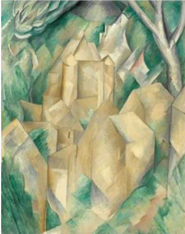
George Braque, Castle at Roche-Guyon, 1909, oil on canvas, 251/2 x 211/2, MoMA. PD US

George Braque was a little older than Picasso. He had been painting in an Impressionist, then Fauvist style. After Cézanne died in 1906, his paintings were exhibited in a large retrospective in 1907. The breaking up of forms into planes of space with brushwork and color greatly influenced Braque. He even painted some of Cézanne's motifs like the Castle at Roche-Guyon.