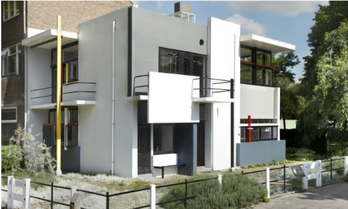
Gerrit Rietveld, Schroeder House, Utrecht, The Netherlands, 1924.

architecture department during its first years. Nonetheless, the school was founded on the idea of “total” creativity, or gesamtkunstwerk , in which all arts would be brought together. Many well-known artists attended the Bauhaus, including Josef Albers, Anni Albers, Laszlo Moholy-Nagy, Paul Klee, Wassily Kandinsky, Piet Mondrian, Max Bill, and Herbert Bayer. The Bauhaus style became one of the most influential currents in Modernist architecture and modern design, having a profound influence on subsequent developments in art, architecture, graphic design, interior design, industrial design, and typography.