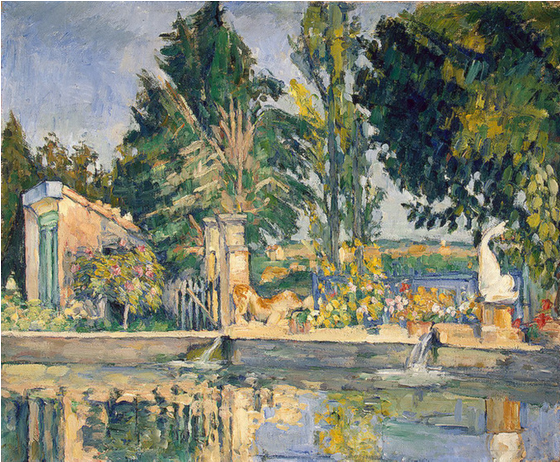
Cezanne, The Pond of Jas de Bouffan, 1876. oil on canvas, 18.1 x 22.2", Hermitage Museum. Under the Impressionist's influence, Cezanne's works became much brighter and looser in style.

provided some financial relief. On the whole, however, Cézanne's exhibited paintings attracted hilarity, outrage, and sarcasm.