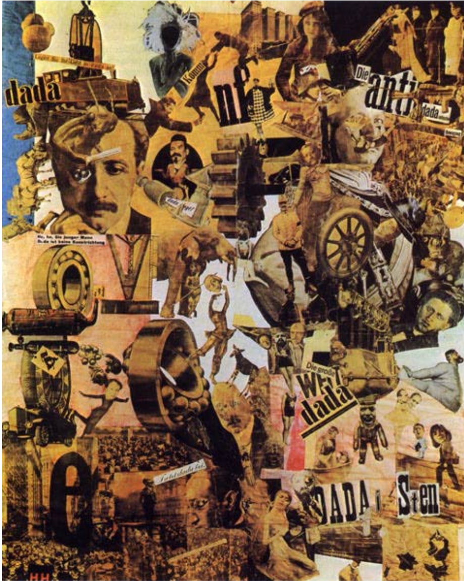
Hannah Hoch, Cut with a Kitchen Knife through the Weimar Beer Belly of the First Cultural Epoch in Germany, 1919, collage, 144 x 90 cm, Berlin.