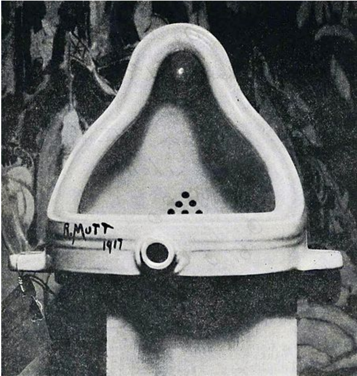
Marcel Duchamp, Fountain , 1917. Photograph by Alfred Stieglitz. Porcelain urinal with paint. MoMA. PD US

Duchamp's work would bear fruit in the 1960s and after with the movements of Pop Art, Happenings, Fluxus, and Conceptual Art.