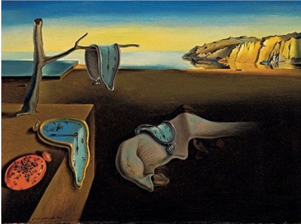
Salvador Dalí, The Persistence of Memory , 1931. Oil on canvas, 9 ½ x 13", MoMA.