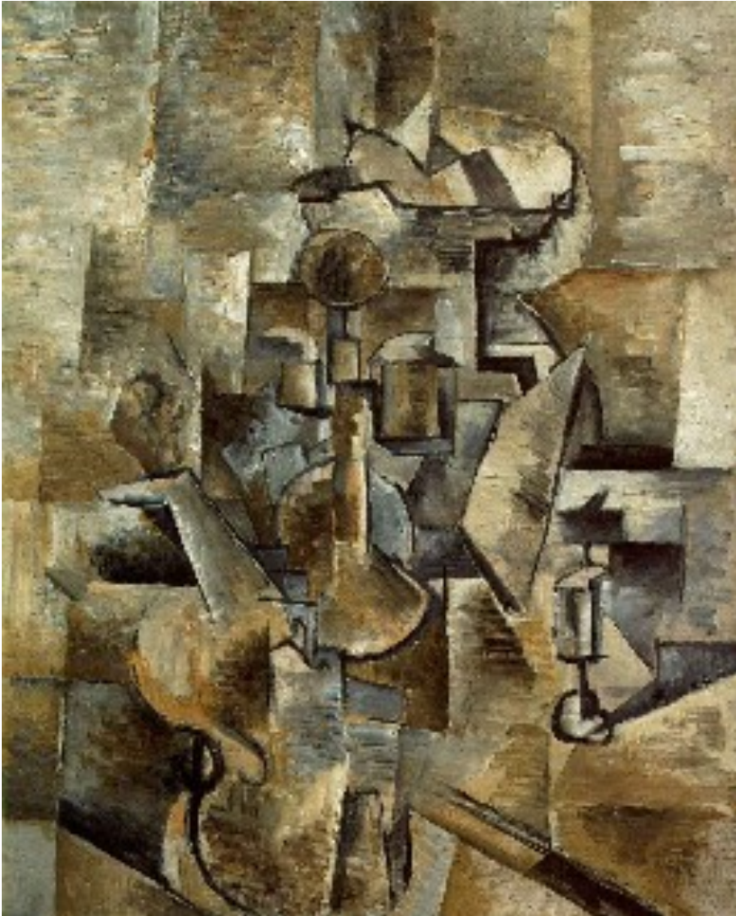
Violin and Candlestick by Georges Braque, 1910: Georges Braque, with Picasso, was one of the founders of Cubism.

Cubism had a global reach as a movement, influencing similar schools of thought in literature, music, and architecture. Particular offshoots beyond France included the movements of Futurism, Suprematism, Dada, Constructivism, and De Stijl, which all developed in response to Cubism. Early Futurist paintings have some commonalities with Cubism: the fusing of the past and the present and the representation of different views of the subject pictured at the same time, also called multiple perspective, simultaneity or multiplicity. Constructivism was influenced by Picasso's technique of constructing sculpture from separate elements. Other common threads between these disparate movements include the faceting or simplification of geometric forms, and the association of mechanization and modern life.