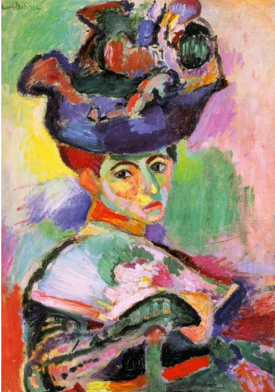
Woman with a Hat by Henri Matisse, 1905.: This painting was rejected by critics when initially exhibited, but was soon acquired by avant-garde collectors Leo and Gertrude Stein.

beasts,” which the artists then appropriated as the title for their movement. The painting that was singled out for special condemnation, Matisse’s Woman with a Hat , was subsequently bought by the major patrons of the avant-garde scene in Paris, Gertrude and Leo Stein.