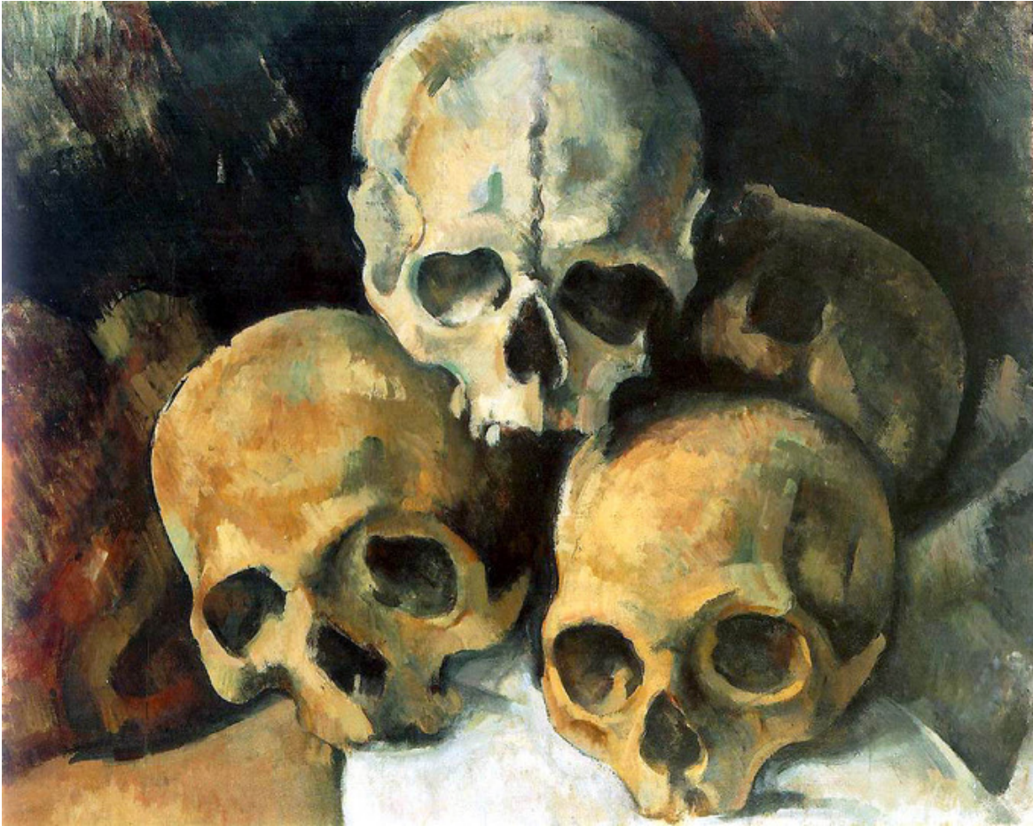
Pyramid of Skulls, c. 1901: The dramatic resignation to death informs several still life paintings Cézanne made between 1898 and 1905.

Cézanne's explorations of geometric simplification and optical phenomena inspired Picasso, Braque, Gris, and others to experiment with ever more complex multiple views of the same subject. Cézanne thus sparked one of the most revolutionary areas of artistic enquiry of the 20th century, one which was to affect the development of modern art. A prize for special achievement in the arts was created in his memory. The "Cézanne medal" is granted by the French city of Aix en Provence.