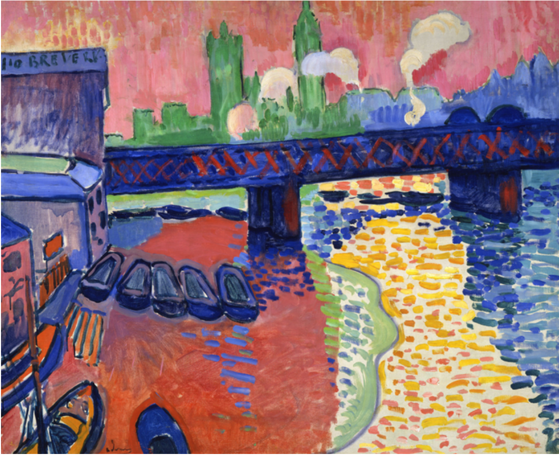
Charing Cross Bridge, London by André Derain, 1906: The vibrant, surprising use of color in this work is characteristic of the Fauvist style.

Apart from Matisse and Derain, other artists included Albert Marquet, Charles Camoin, Louis Valtat, the Belgian painter Henri Evenepoel, Maurice Marinot, Jean Puy, Maurice de Vlaminck, Henri Manguin, Raoul Dufy, Othon Friesz, Georges Rouault, the Dutch painter Kees van Dongen, the Swiss painter Alice Bailly, and Georges Braque (subsequently Picasso's partner in Cubism).