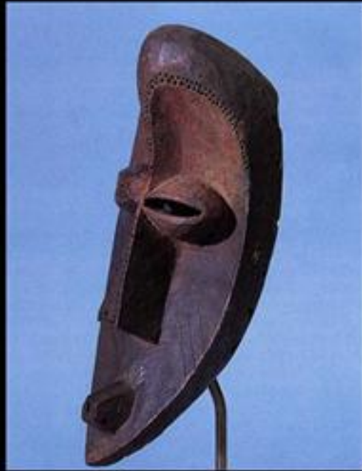
Costa de Marfil

Cerrar o aprete tecla ESC http://www.elacontecer.com.uy/contratapa/917-amanecer-del-arte-moderno.html