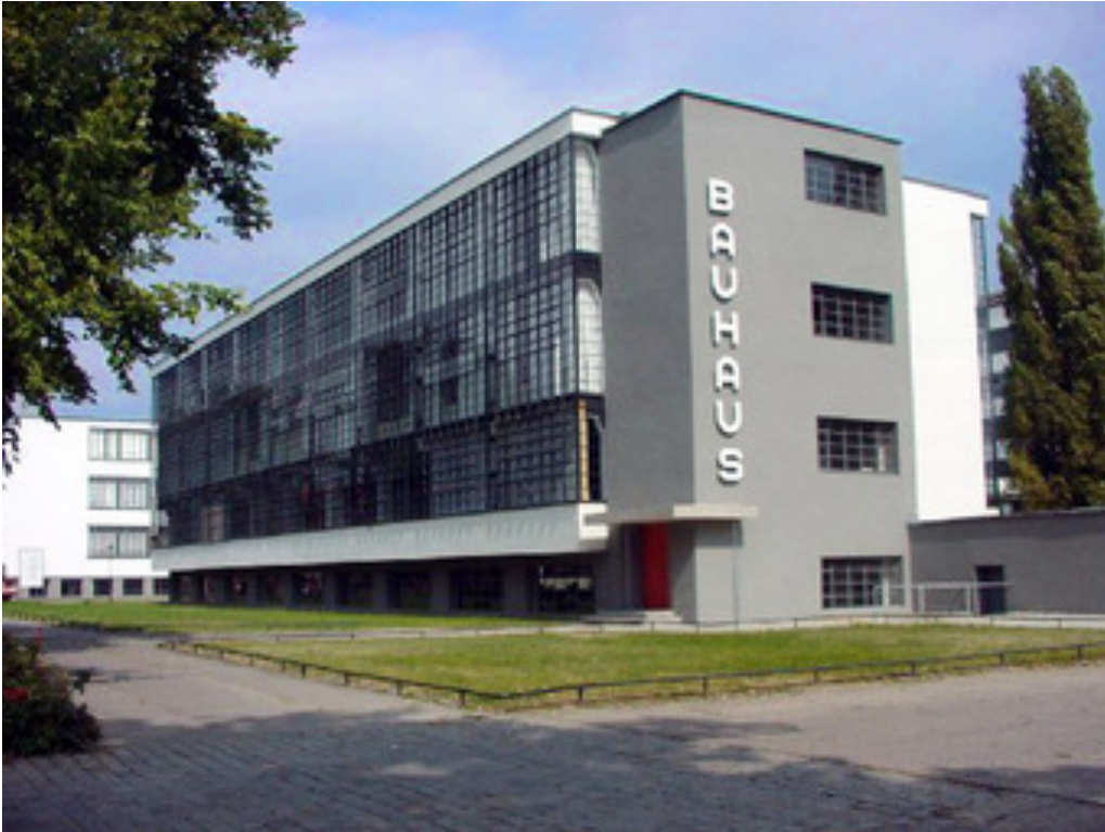
The Bauhaus in Dessau, Germany: Bauhaus means “house of construction.”