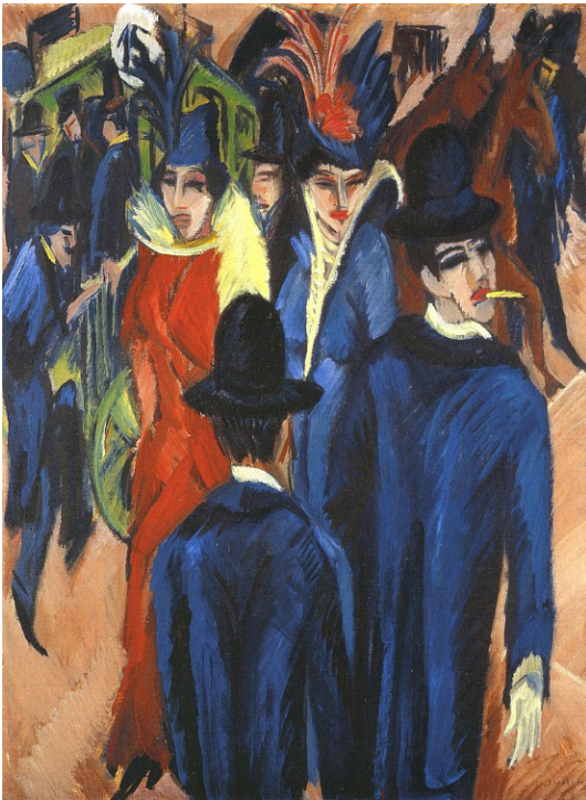
Ernst Ludwig Kirchner , Berlin Street Scene , 1913. Oil on canvas, 47.6 x 37.4", New York, MoMA, 2008. PD US

Expressionist painters had many influences, among them Edvard Munch, Vincent van Gogh, and several African artists. They were also aware of the Fauvist movement in Paris, which influenced Expressionism's tendency toward arbitrary colors and jarring compositions.