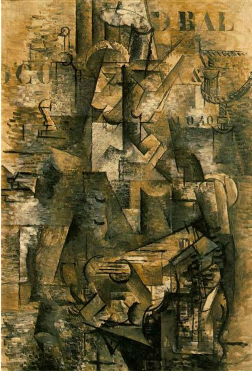
Braque, The Portuguese , 1911, oil on canvas, 81 x 118.8 cm, Basel Public domain US

In Cubist artwork, objects are analyzed, broken up, and reassembled in an abstracted form. Instead of depicting objects from one viewpoint, the artist depicts the subject from a multitude of viewpoints to represent the subject in a greater context.